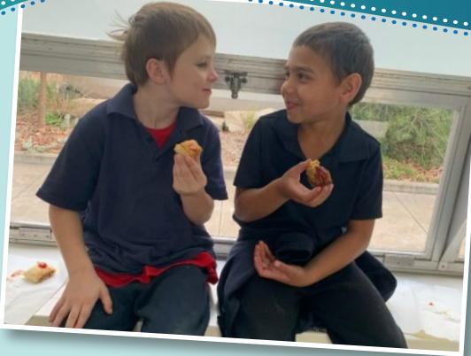
Wandana Warriors and Minimar Mob (See article next page)